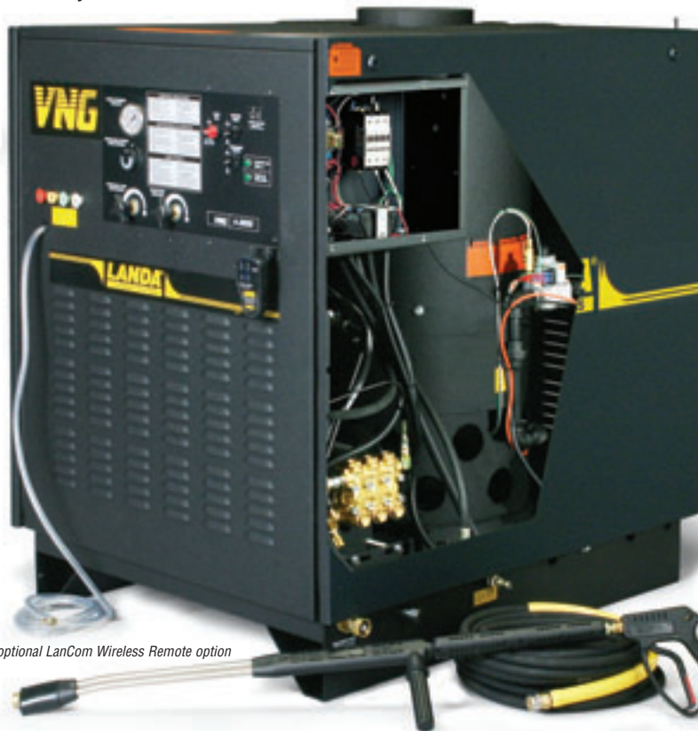
Shown with optional LanCom Wireless Remote option

■ Helpful Tri-Lingual Labels with operating instructions in English, Spanish and French for owner and operator protection.